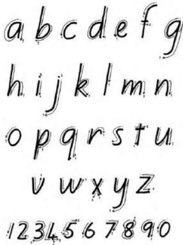
Lower Case Letters